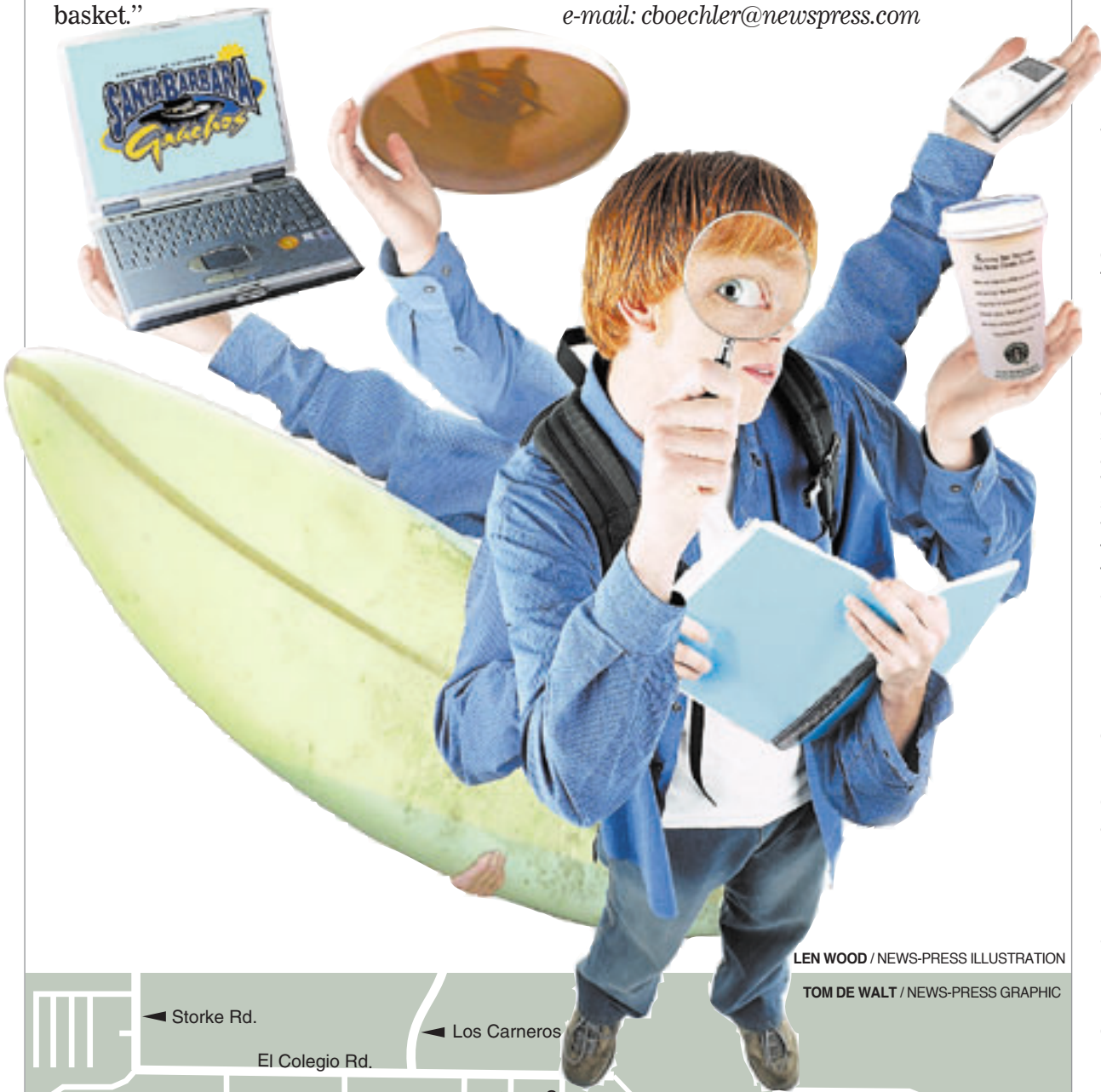
LEN WOOD / NEWS-PRESS ILLUSTRATION TOM DE WALT / NEWS-PRESS GRAPHIC